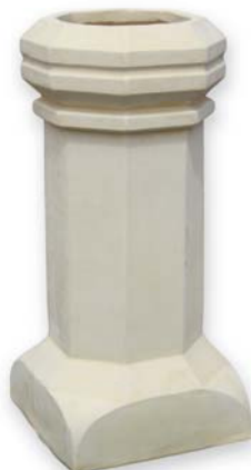
Buff Clay (through color)