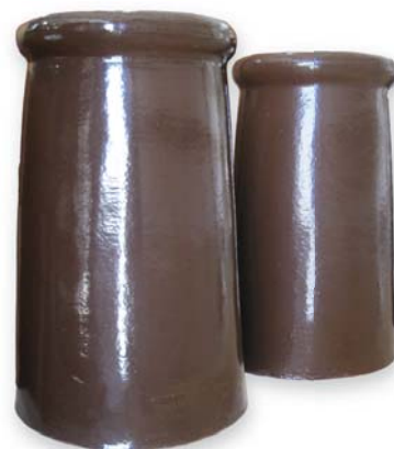
Brown (Gloss Glaze)