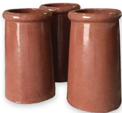
Salt (Gloss Glaze)