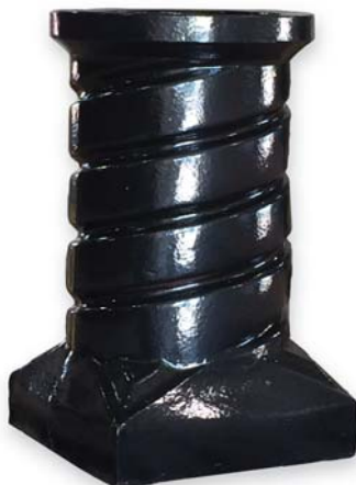
Black (Gloss Glaze)