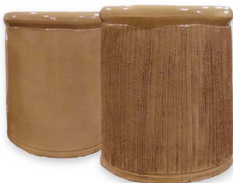
Tan (Gloss Glaze)

Glazes for chimney tops are special order. Delivery times will be longer than the standard terra cotta. Typically a glazed unit will have a lead time of approximately 2-4 weeks. Check with your distributor for exact timing and details when placing an order. Please note colors shown above are approximate and should not be considered a color swatch for matching purposes. Actual sample chips are available upon request.